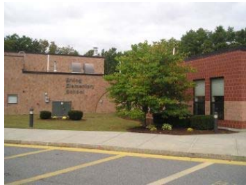
Erving Elementary School