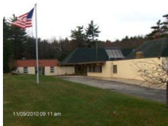
Swift River School