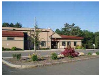
Shutesbury Elementary School