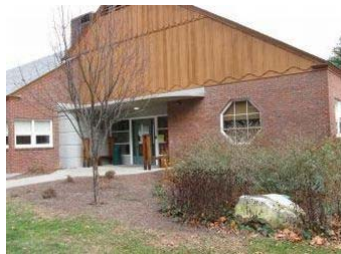
Leverett Elementary School